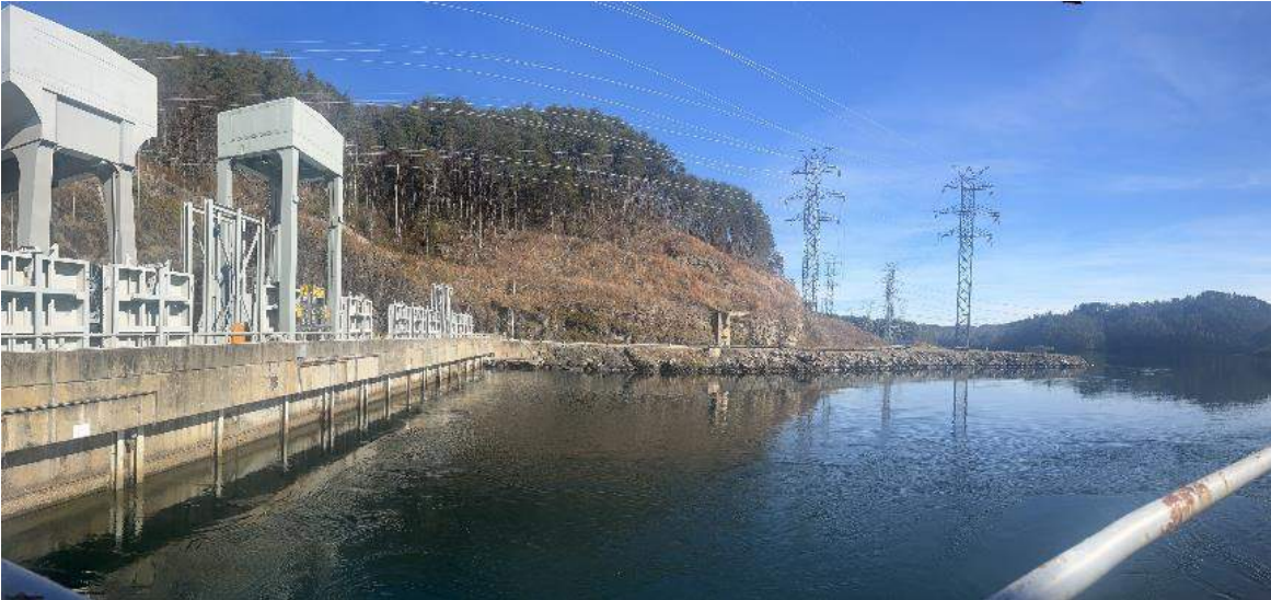
Jocassee Hydro Facility and Duke World of Energy