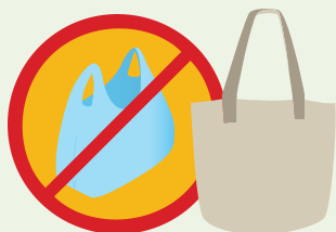
Plastic & Paper Bags