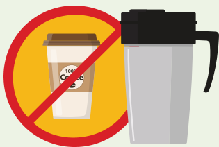
Paper Coffee Cups