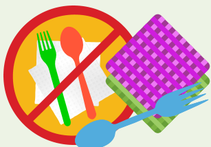
Plastic Utensils & Paper Napkins