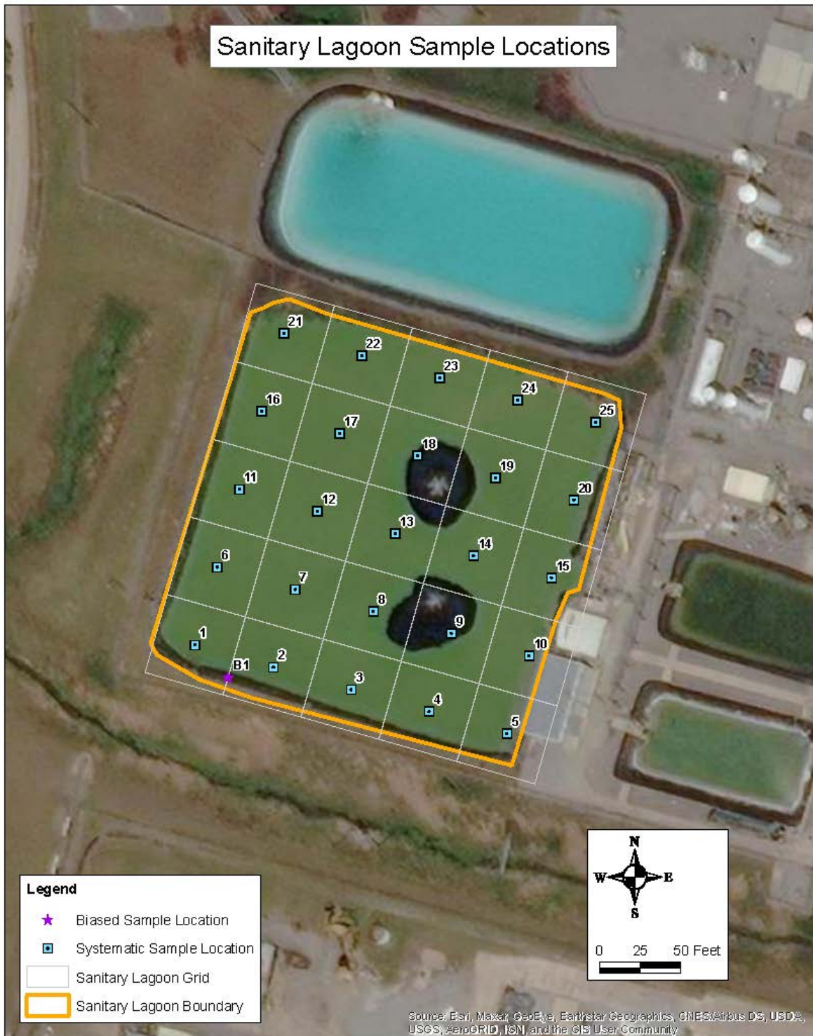
Figure 1 – CFFF Sanitary Lagoon Sampling Grid